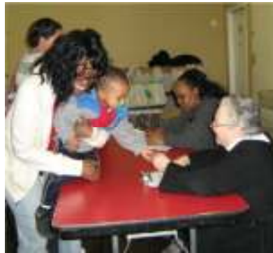
Signing in food pantry participants