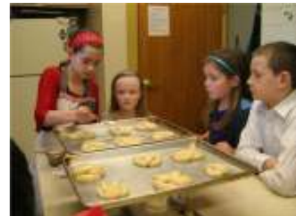
Making pretzels for a lesson in prayer