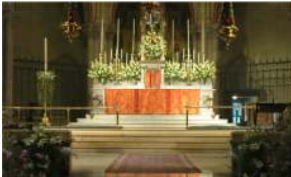
The high altar