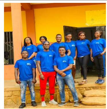
Cross section of some team members